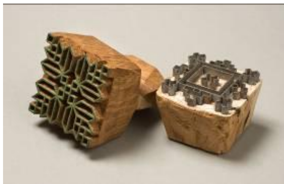
Some embroidery printing blocks from Ahmedabad India now in the TRC collection ( ; TRC 2008.0355 and TRC 2008.0356)