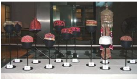
Various caps on display in the Afghan dress exhibition, Volkenkunde Museum, Leiden

The theme of the 2008 Nauruz (New Year Festival) TRC display in the Volkenkunde Museum, Leiden, was New Clothes for the New Year . We wanted to show Afghan dress at its best. So the display included both festival and daily garments and jewellery for men, women and children from all the main groups including Baluch, Hazara, Nuristani, Pashtun, Tajik, and Turkmen items. This exhibition was increased in size from previous years by the inclusion of a collection of men and women's caps from various regions of Afghanistan.