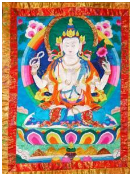
An appliqué thangka depicting Chenrezig, the patron and protector of Tibet. He is holding a white mala (prayer beads) in his upper, right hand (TRC 2007.1162).