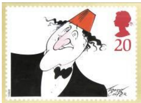
A British stamp depicting Tommy Cooper wearing a tarbush, or is it a fez?

A simple question can often lead to making a small collection! The TRC was asked whether Tommy Cooper, the famous English comedian, was wearing a fez or a tarbush? This question was to result in the TRC carrying out research into its own collection of fezzes and tarbushes to see what, if any, the difference was. The results were surprising – yes there is a subtle difference, but it was a difference that carried significant social and ethnic weight within the Turkish and Arab worlds. Was the wearer a Turk or an Arab, official or not, and so forth. In addition the use of tarbushes was taken to America in the late 19 th century, where it became an important aspect of the Shriners' (a Masonic group) fund raising activities to support children's hospitals.