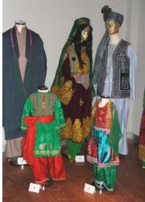
Pashtun garments in the Afghan dress exhibition, Volkenkunde Museum, Leiden