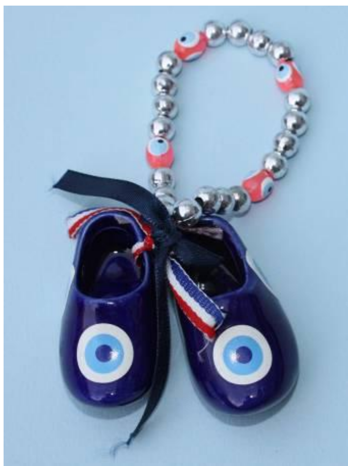
A pair of anti-‘evil eye’ clogs (TRC 2008.305a-b)

Textile Research Centre, National Museum of Ethnology, Leiden, The Netherlands