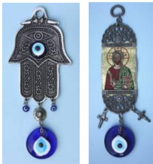
Jewish and Christian amulets with blue and white evil eye pendants (TRC 2008.308 and TRC 2008.315)

Evil eye amulets is a small exhibition on the role of an amulet in the form of a blue and white eye that can be found throughout the Middle East, literally from Turkey to Central Asia. The clogs on the front cover of this report were found in Paris, France, and are actually a pair of Dutch clogs that have been ‘converted’ into an evil eye amulet by painting them with blue and white eyes