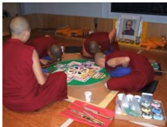
The Buddhist nuns at prayer/work in the Volkenkunde Museum, Leiden

January also saw the arrival of a Buddhist nun's outfit from Nepal. In 2007 the Volkenkunde Museum was the host of several Nepali nuns who stayed for a week. During this time it was agreed that the TRC would acquire a nun's outfit from them in return for a donation to the nun's monastery in Nepal, which was agreed to with great pleasure.