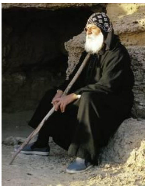
A Coptic monk wearing a characteristic hood with 1 large and 12 small crosses, representing Christ and the 12 apostles (photograph by courtesy of K. Innemee).

There are now a number of digital exhibitions on the TRC website including: Afghan embroidery , which looks at the main types of embroidery to be found in Afghanistan. The exhibition was created by Qudsia Zohab, Kabul, Afghanistan, as part of her training in Leiden. In addition, she made a small Object of the Month exhibition about quls – the beaded or embroidered discs on Pashtun women’s clothing.