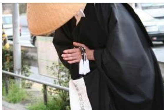
A Japanese priest holding prayer beads in his hand (2008;)

The sight of a person with a string of beads in one hand gently telling the beads is well known throughout the world. They are used by religious and lay individuals and groups, but what exactly is a prayer rope or set of beads, why and how they are used, what are the different forms?