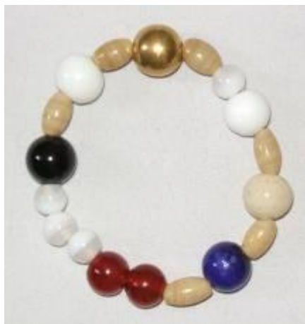
Lutheran 'Pearls of Life' prayer beads (TRC collection)

Prayer beads are one of the few items that join the world religions together. But prayer beads also have economic, gender, social and status functions and roles. The aim of this workshop was to take a broader view about the history and use of prayer beads and to place them within a wider, global setting.