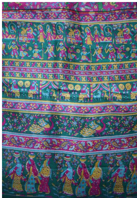
Detail from a printed silk sari (TRC collection)

After considering the nature of the TRC's collection and the theme, it was decided that the TRC would produce a small exhibition on the theme of saris and how they are decorated. It was also agreed that the exhibition will be held in the Volkenkunde Museum, Leiden. The exhibition will be on display for three months from March to May 2010.